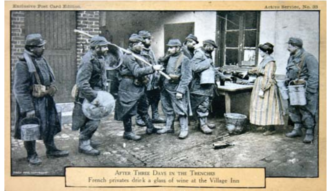
EXCLUSIVE POST CARD EDITION Active Service, No. 33 AFTER THREE DAYS IN THE TRENCHES French privates drink a glass of wine at the Village Inn

You are a rat with a good nose for sniffing out food. Your brothers send you out to see what is being served up in the trenches. Report back.