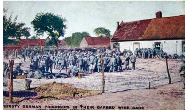
HIRSTY GERMAN PRISONERS IN THEIR BARBED WIRE CAGE

Decide what he would find most useful, and make lists of what you would pack.